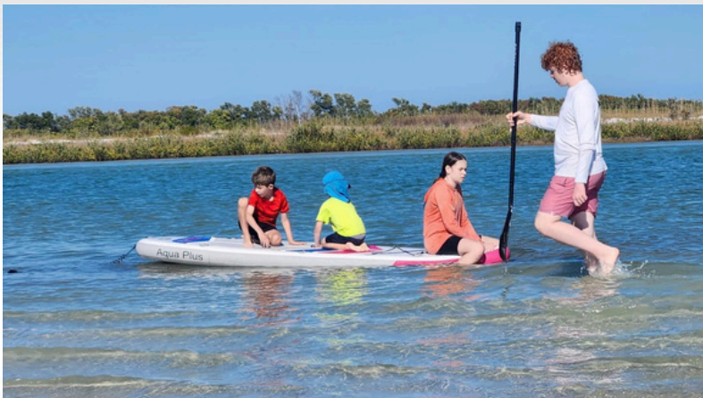
Families discover new skills and intergenerational appreciation camping in our backyard nature preserve at Fort De Soto State Park.