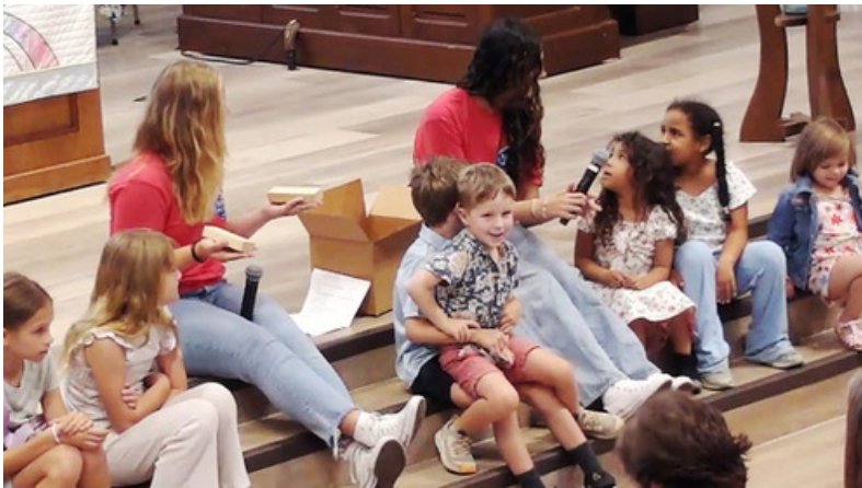
Children's Time creates joy for our whole congregation during our 10 am Sunday worship services.