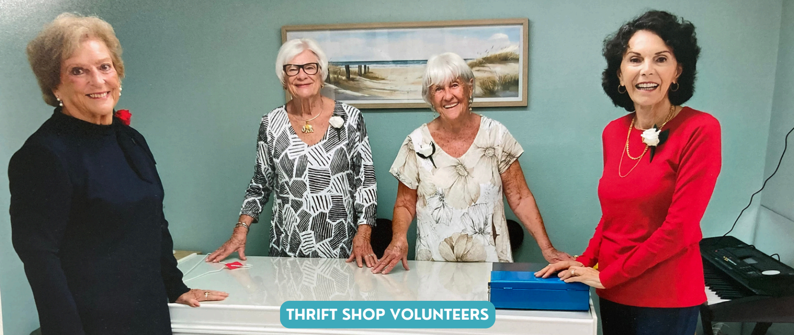
THRIFT SHOP VOLUNTEERS