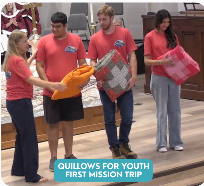
QUILLOWS FOR YOUTH FIRST MISSION TRIP

We have resumed Coffee Hour, and the donations are very generous—lots of cookies and baked goods.