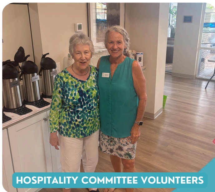
HOSPITALITY COMMITTEE VOLUNTEERS